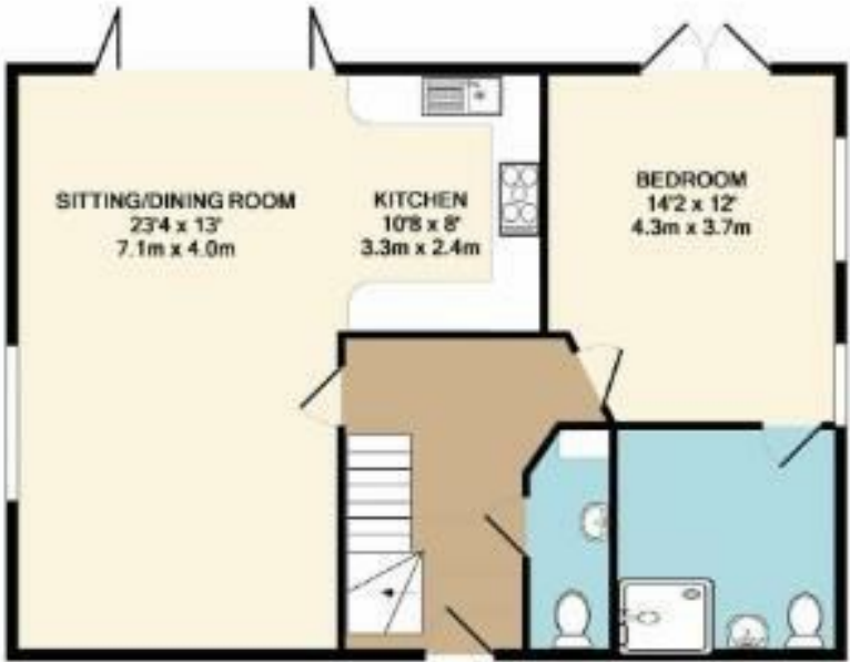
GROUND FLOOR APPROX. FLOOR AREA 768 SQ.FT. (71.4 SQ.M.)

Whilst we endeavour to make our sales particulars accurate and reliable, however, they do not constitute or form part of an offer or any contract and none is to be relied upon as statements of representation or fact. The services, systems and appliances listed in this specification have not been tested by us and no guarantees as to their operating ability or efficiency are given. All measurements have been taken as guide to prospective buyers only, and are not precise. If you require clarification or further information on any points, please contact us, especially if you are travelling some distance to view.